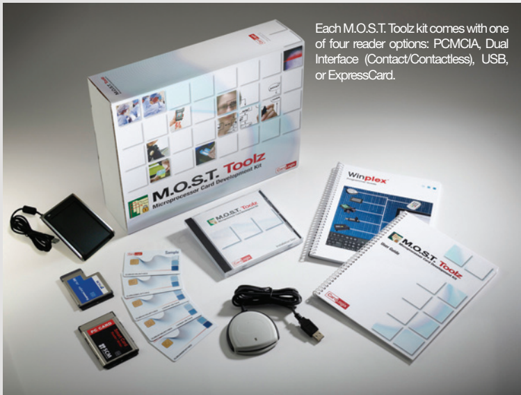
Each M.O.S.T. Toolz kit comes with one of four reader options: PCMCIA, Dual Interface (Contact/Contactless), USB, or ExpressCard.

Designed for multifunction and high security smart card systems, M.O.S.T. Toolz™ is a low-cost standalone complement to the Smart Toolz® Smart Card Application Development Kit. M.O.S.T. Toolz features robust software for rapid system development, plus five microprocessor smart cards for system and file setup and your choice of PCMCIA, USB, ExpressCard, or Dual Interface contact/contactless reader. Visual Basic, .NET, C++, and C# programming examples with full documentation complete the kit.