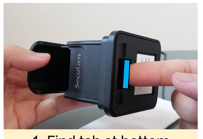
1. Find tab at bottom