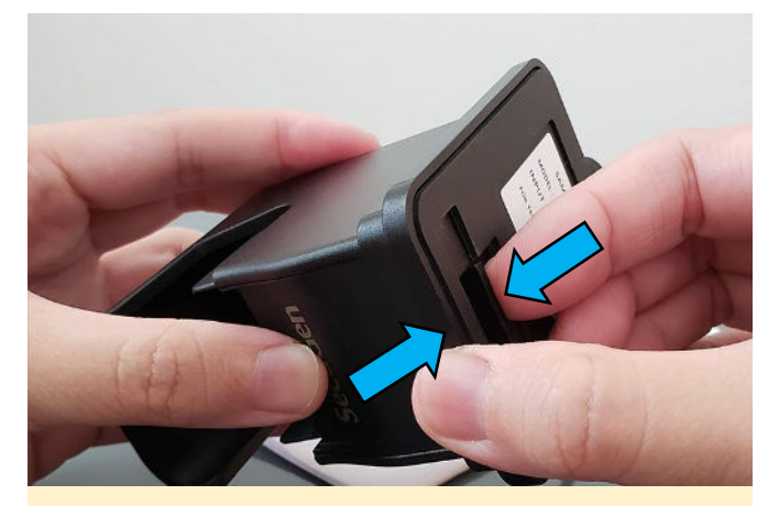
2. Press tab and squeeze