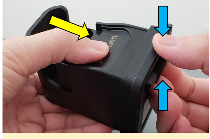
3. Press panel at same time