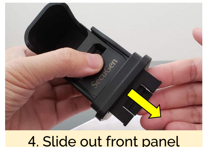
4. Slide out front panel