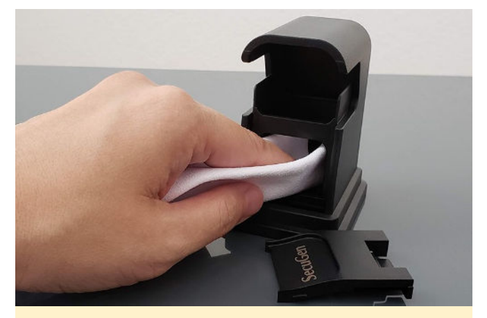
5. Wipe glass with cloth