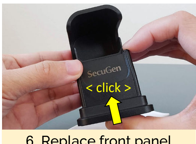
6. Replace front panel