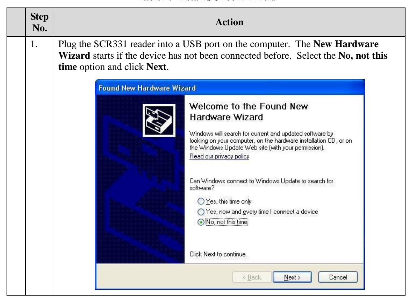
Table 2: Install SCR331 Drivers