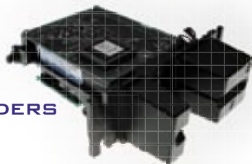
HYBRID INSERT READERS