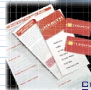
CUSTOM PROMO INSERTS