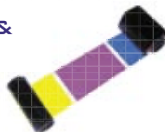
RIBBONS & SUPPLIES

Numerous card printing and packaging options are available to distinguish the look of your system. Options range from simple enhancements to sophisticated security features. Special packaging and shipment choices are also available. Our factory card personalization with a wide range of adjustable options can streamline your distribution and fulfillment tasks. See the CardLogix Graphics and Security Printing Guide for more information.