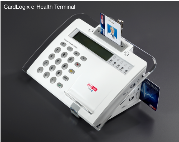
CardLogix e-Health Terminal

Extending the Power of Electronic Medical Records