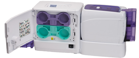
LAMINATOR / NUVIA (DUAL HOPPER) / CRADLE