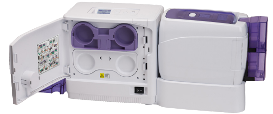
LAMINATOR / NUVIA (SINGLE HOPPER) / CRADLE