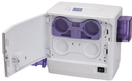
SINGLE SIDED LAMINATOR