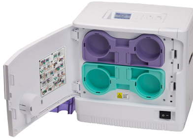
DUAL SIDED LAMINATOR