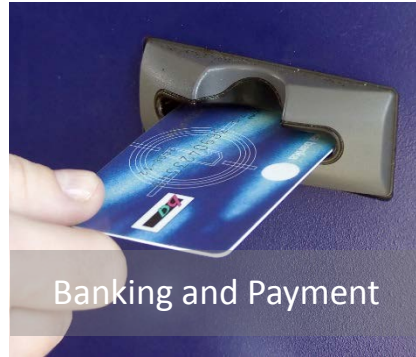
Banking and Payment