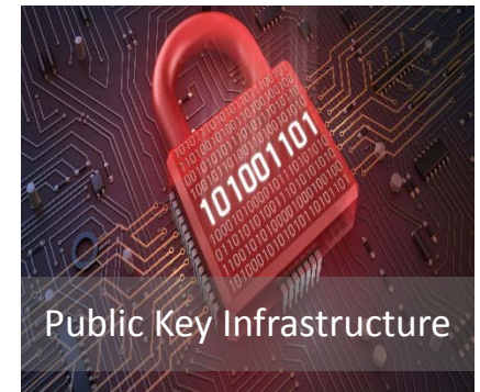
Public Key Infrastructure