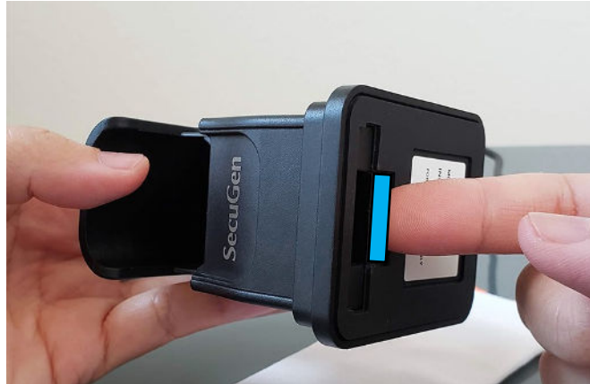
1. Find tab at bottom