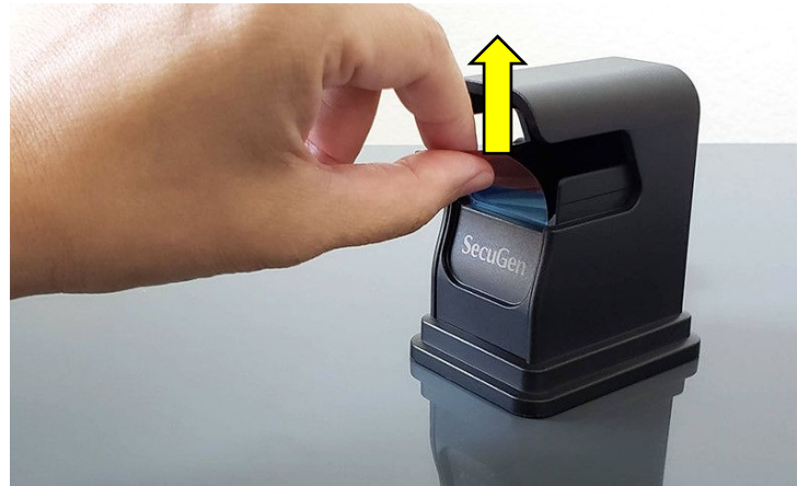
2. Pull up on red tab