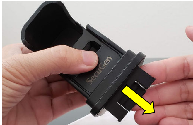
4. Slide out front panel