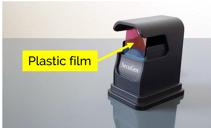
1. Remove plastic film