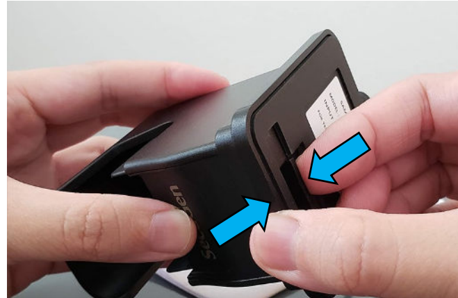
2. Press tab and squeeze