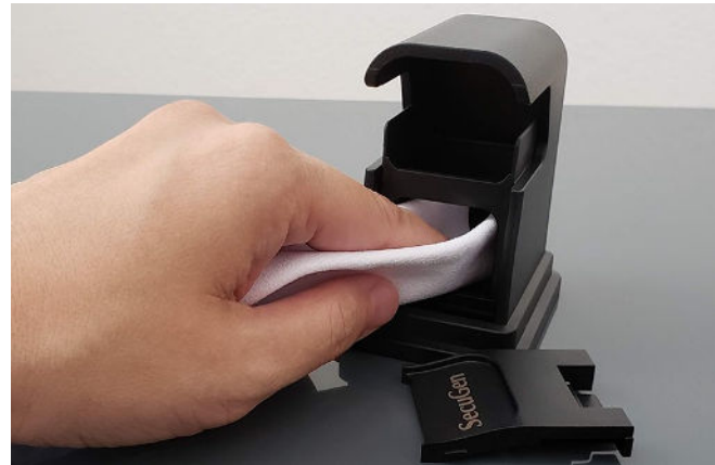
5. Wipe glass with cloth