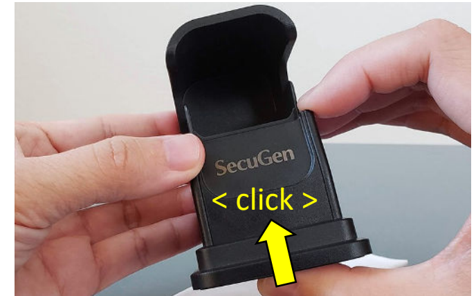
6. Replace front panel