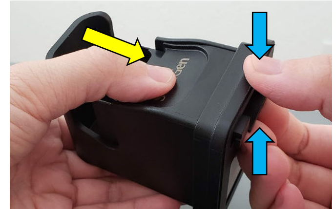
3. Press panel at same time